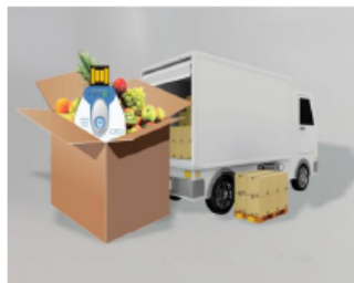
Put into the box / carton