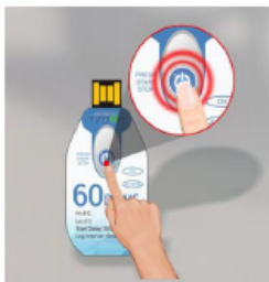
Press the button to start