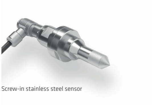
Screw-in stainless steel sensor

humidity and records changes during transport or storage. + With transport data loggers, combined with combi-sensors, the packaging and logistics of climatically sensitive products can be monitored and optimized, including dew point monitoring and condensation control. + Or they document compliance with logistics regulations when transporting highly sensitive optical systems or lithography systems. + The combi-sensors have a long-term stability and their measurements are extremely precise even under extreme conditions. + They are supplied calibrated, with a factory certificate, and they can be used immediately - also in customised designs.