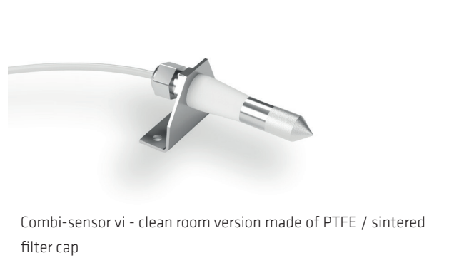
Combi-sensor vi - clean room version made of PTFE / sintered filter cap