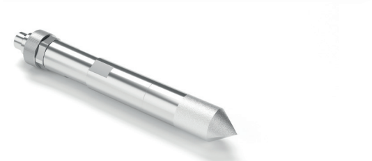
Mounting sensor - to be installed on the data logger